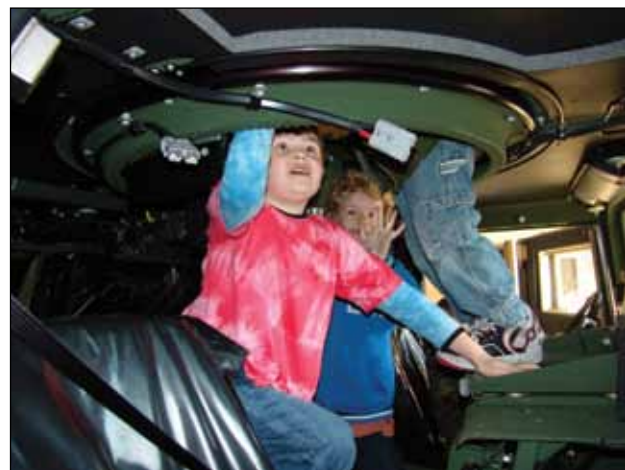
Students from Livorno Unit Elementary School explore the turret of a HUMVEE during career day visit to 3/405th Army Field Support Brigade. The kids also got a chance to visit the Camp Darby health clinic, the Military Police station, and American Forces Network Livorno.

Because not every child gets the chance to see what their parent or any